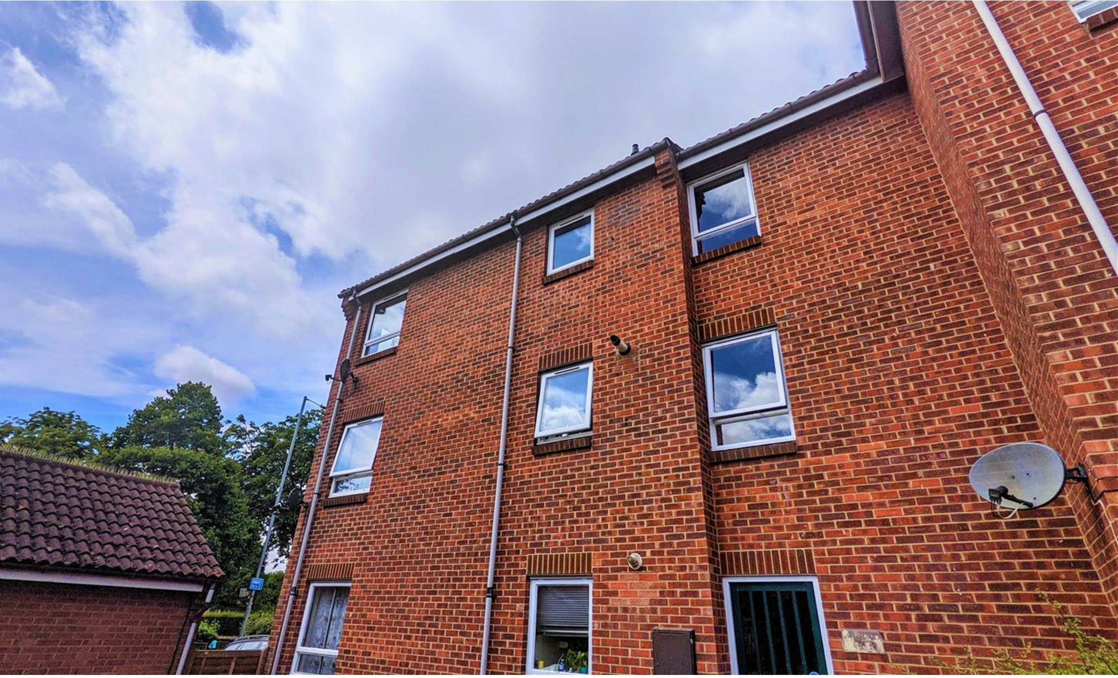
Baxter Court | Norwich | NR3 Guide Price £125,000

Disclaimer – In accordance with the Property Misdescriptions Act, the company gives notice that all descriptions, references to condition, necessary permissions for use and other details are given in good faith and believed to be correct, but any intending lessees do not rely on them as statements of fact, but must satisfy themselves by inspection or other means, as to their accuracy.